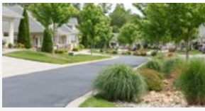
Garden Place Court