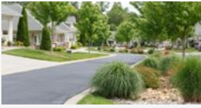
Garden Place Court