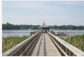
Dock to Chester River