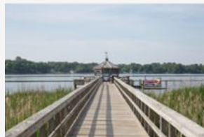
Dock to Chester River