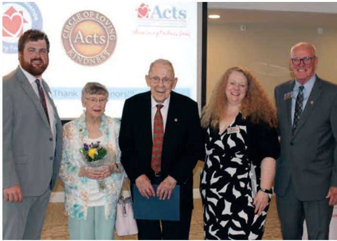
Park Pointe Village Circle of Loving-Kindness Luncheon