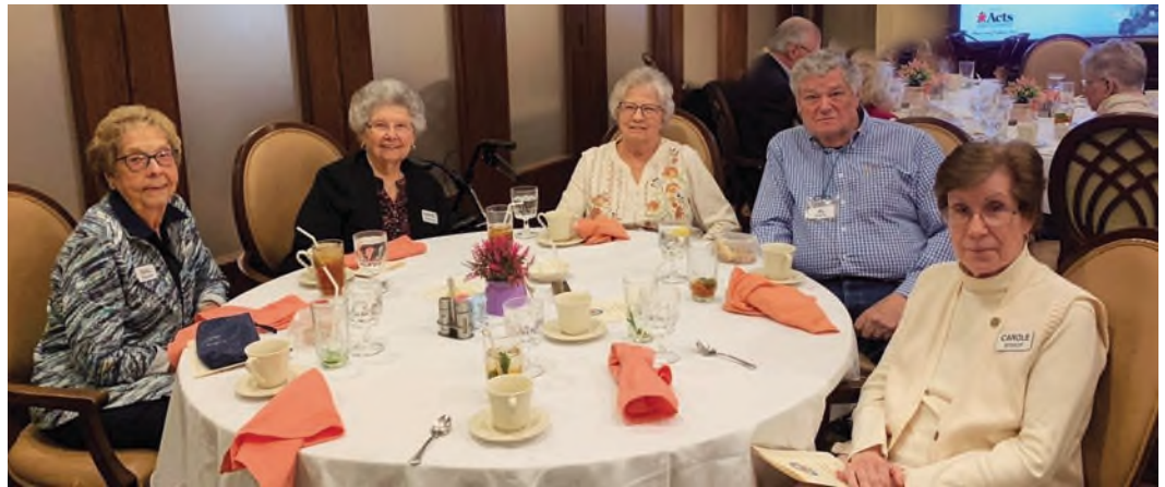
Spring House Estates Circle of Loving-Kindness recognition luncheon