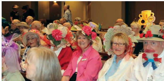
Tryon Estates Morris Derby fundraiser to benefit the Samaritan Fund