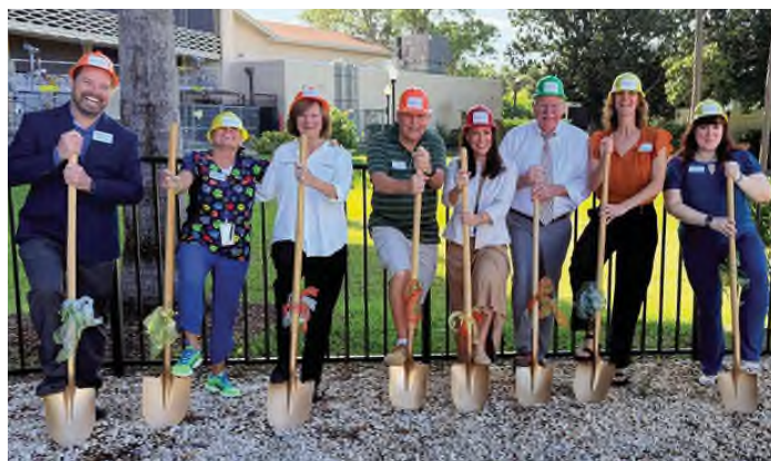
Groundbreaking for donor-funded pool shades at Mease Life