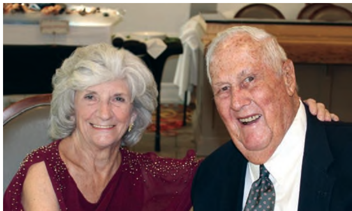
Westminster Gala to benefit community wellness and rehabilitation services