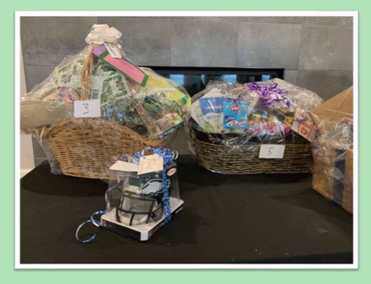
Thank you for joining Acts and friends in support of the Acts Samaritan Fund.